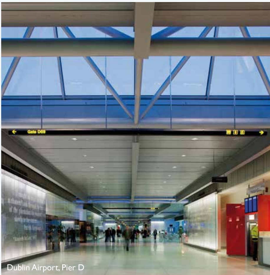
Dublin Airport, Pier D

DAL understands the complex safety requirements of products for public areas. The necessary Ingress Protection for exterior or harsh environments must be ensured. Glare control and light distribution are key to the comfort and safety of people within these spaces. The products energy consumption is of prime importance to the environment. DAL has a wealth of experience in the design and manufacture of luminaires for harsh weather and extreme conditions, also bomb and fire proofing.