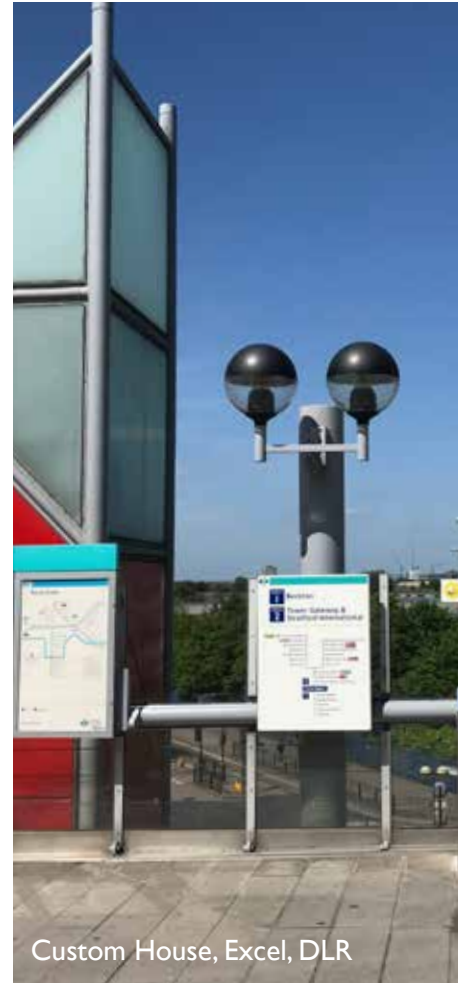
Custom House, Excel, DLR