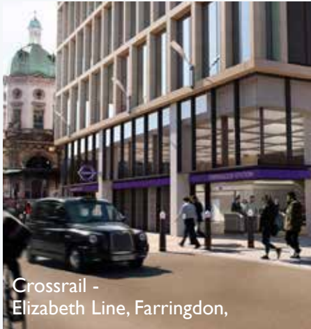
Crossrail - Elizabeth Line, Farringdon,

DAL has been involved in all aspects of transport lighting since they began trading in 1984. Standard products and custom designed luminaires have been supplied to many projects including station platforms, airport terminals, train carriages, cruise ships, pedestrian foot bridges and riverside pontoons. DAL even designed luminaires for recreational transportation projects.