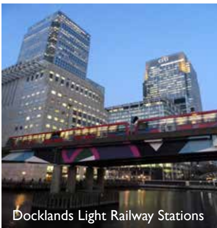
Docklands Light Railway Stations