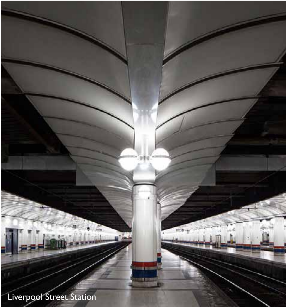
Liverpool Street Station

DUTY FREE, CONCOURSES, CHECK-IN, WASHROOMS, PLATFORMS, PASSAGEWAYS CARRIAGES, TICKET OFFICES, BRIDGES, WALKWAYS, PONTOONS